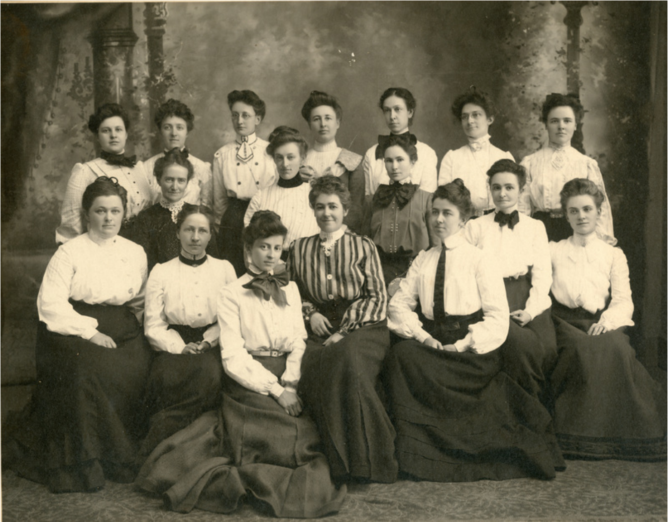
Members of the Tourist Club, a group of women that supported learning and self improvement, Barre (no date).