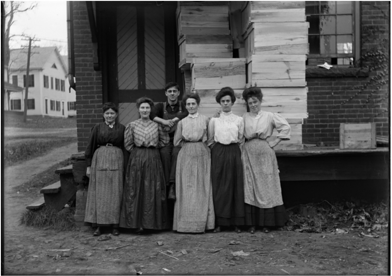
Five women and one man at loading dock of Cole Paper Mill, Putney (1908).