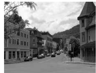
Town of Hardwick

Check out our website at vmbb.org . You can review and print loan schedules of projects that have been financed through VMBB and SRF programs. Or you can request an application for a new project.